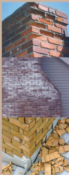
Severe spalling and deterioration is caused by water penetration

Chimneys are highly exposed to the elements and if left unprotected, are susceptible to structural deterioration. It is important to address this problem before serious damage occurs. A complete protection program should include a chimney cap and repair of any cracks or deterioration on the crown, mortar joints and flashing; in addition to an application of ChimneySaver Water Repellent to the entire chimney.