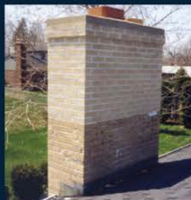
This partially rebuilt chimney would continue to deteriorate if left unprotected.

ChimneySaver is 100% vapor permeable - a non film-forming water repellent that penetrates and lines masonry pores.